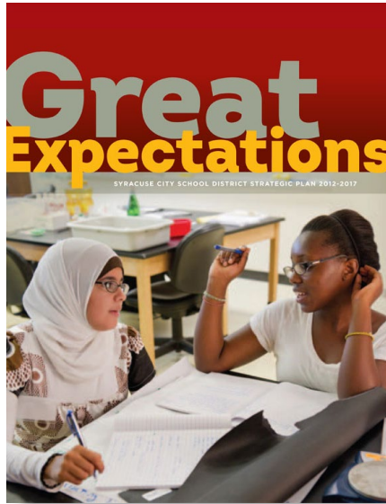
2012 – 2017 Strategic Plan