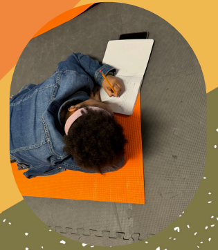
Students self-reflecting in the Mindfulness and Literacy class.