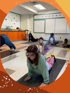
Students learning yoga in the Mindfulness and Literacy class.