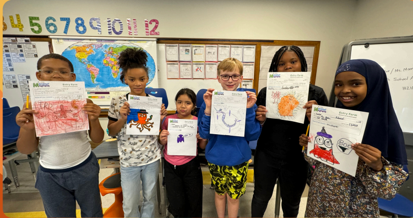
Students participating in an art contest in Ms. Moon's Afterschool class.