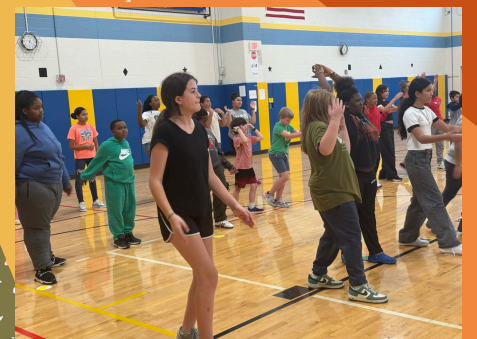
Students learning Brazilian Dance with a guest presenter.